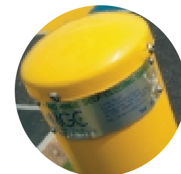
vandal resistant mechanism