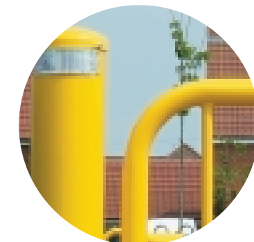
variable closing speed