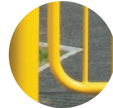
no crush points or shear actions